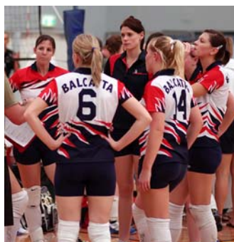
Back in business - the inform Balcatta women's Superleague moved into second spot on the PVL ladder during the week.