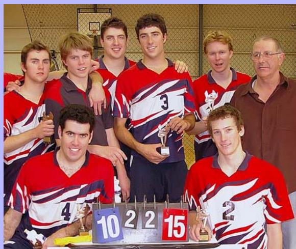
Back on track - Reigning Superleague Premiers Balcatta have now won their last two games to get their season back on track after losing the first two games.