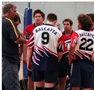
Big win - Balcatta Div. 1 boys beat Southern Cross Masters in straight sets last weekend.