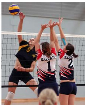
On the board - Balcatta Superleague played a double-header last Sunday, beating Coastal in five sets