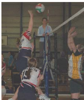
Under pressure - Balcatta beat UWA on Sunday to win three games in a row and maintain its unbeaten run in 2009.