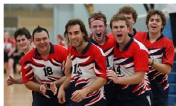
Celebration time - Division 2 premiers