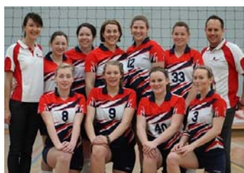
Minor premiers - Balcatta Division 1 women pose for photo before the 2009 grand final against UWA.