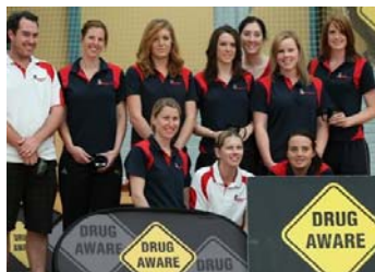
High performers - Balcatta Superleague were runner-up champions in 2009 after making the grand final for the first time in ten years.