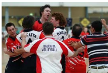
Back-to-back premiers - Balcatta players celebrate the club's second premiership in two years in Division 3.