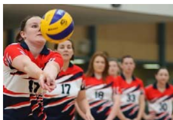
Cats everywhere - The courts were a sea of blue and red with seven Balcatta teams making it through to the grand final.

Bal. Blue b SX Cross Penrhos A 3-1 25-9, 20-25, 25-22, 25-18